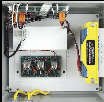
Connects Easily to Control Panel